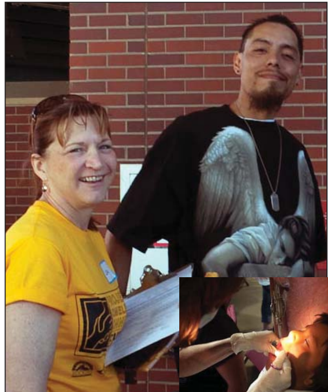
ABOVE: A PHC 9 volunteer and her happy client.

More than 300 service providers spent valuable, personal time with each client and client family delivering amazing support and guidance to help them get back on the road to independence and self-sufficiency.