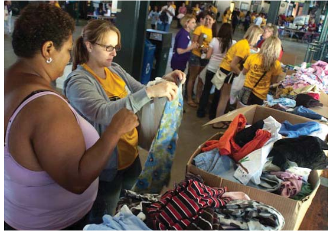
A PHC 9 volunteer and her client shop for clothing.

The next Project Homeless Connect is set for the Fall of 2010, when more help and more volunteers gather to make a difference and improve people’s lives.