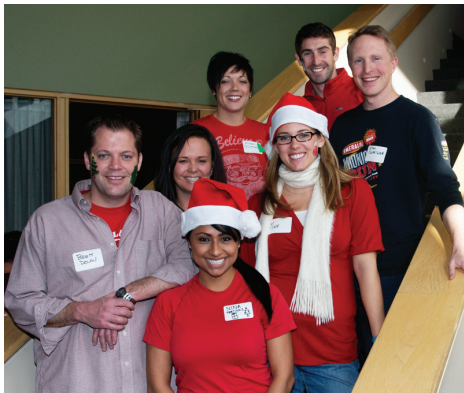
ELC Leadership at the 2010 Ho-Ho-Ho Holiday party

Mile High United Way's Emerging Leaders Council brings the passion and philanthropic power of young professionals together to create a better community. Through the development of emerging leaders in the community, we inspire, educate and empower others to bring about meaningful change by: